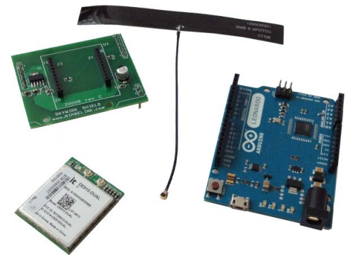
Complete System Setup

Development Kit - Software Examples (ZIP)