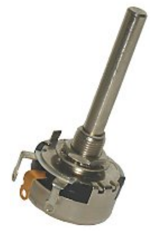
Representative photograph, actual product appearance may vary.

Due to regional agency approval requirements, some products may not be available in your area. Please contact your regional Honeywell office regarding your product of choice.