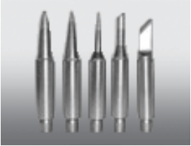
Replacement Soldering Tips H Series