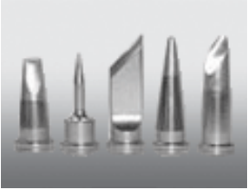
Replacement Soldering Tips W Series