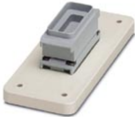
Adapter plate, size B16, reinforced, including panel mounting frame with DSUB 9 protective cover and without contact insert

Please be informed that the data shown in this PDF Document is generated from our Online Catalog. Please find the complete data in the user's documentation. Our General Terms of Use for Downloads are valid ( http://download.phoenixcontact.com )