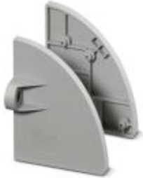
Flange cover, Color: gray

Please be informed that the data shown in this PDF Document is generated from our Online Catalog. Please find the complete data in the user's documentation. Our General Terms of Use for Downloads are valid ( http://download.phoenixcontact.com )